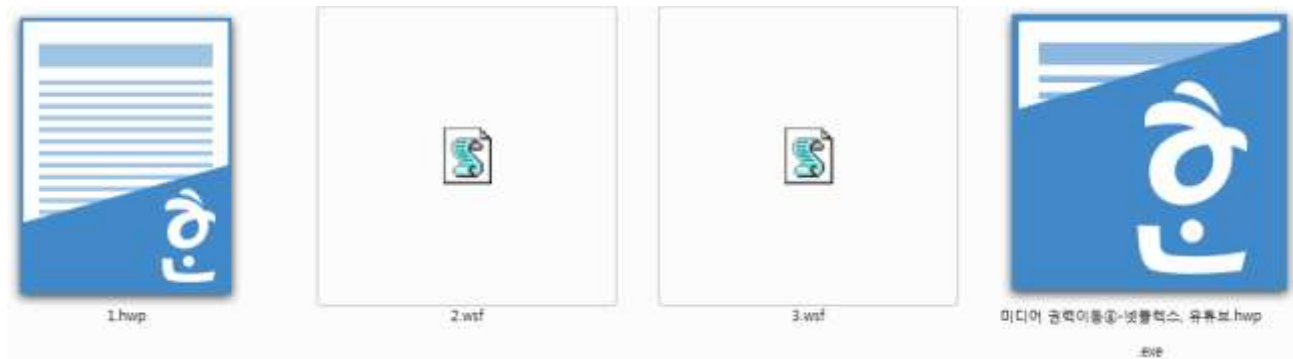
Figure 2. Malware distributed to press corps members

2, the attachment contains a seemingly ordinary PDF file and a malicious file with a double extension (*.hwp[blank].exe)