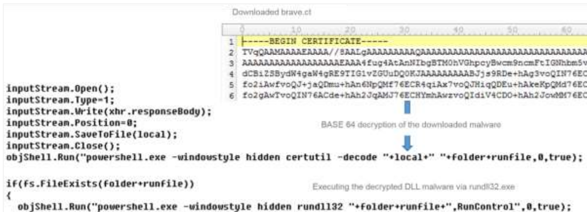
Figure 5. Executing the additionally-downloaded malware

The malware (brave.ct) downloaded by 2.wsf is decrypted in the process shown in Figure 5, and the file Freedom.dll created in the process is executed via PowerShell. If the infected PC is running in a 64-bit Windows environment, another file named AhnLabMon.dll is created.