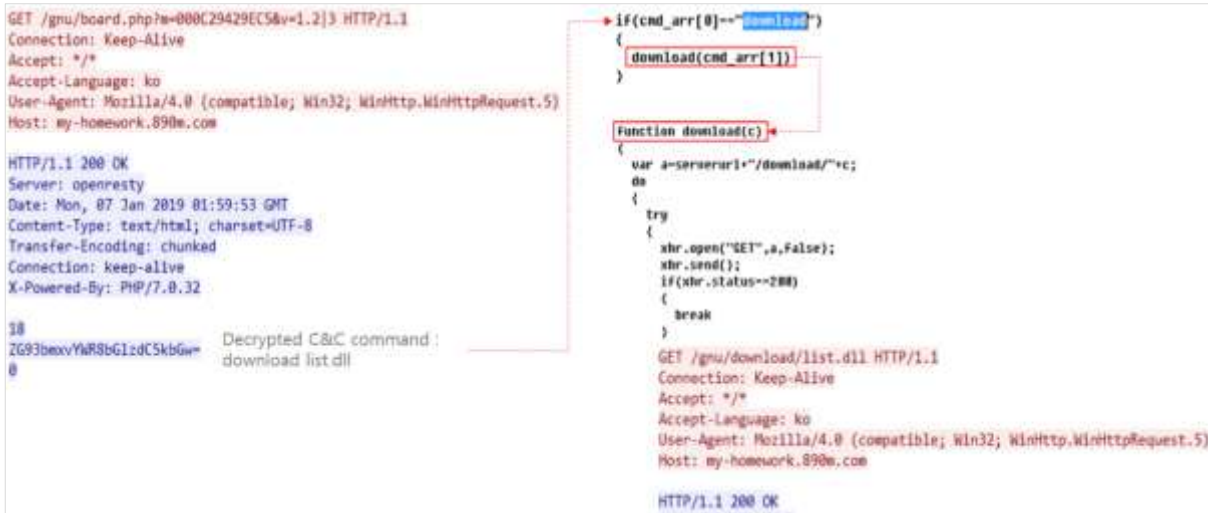
Figure 8. Downloading the malware via C&C server communication

contain the codes for executing the downloaded list.dll (or Cobra.dll). Instead, Freedom.dll (or AhnLabMon.dll), which is downloaded by 2.wsf, is confirmed to download and execute the same list.dll (Cobra.dll). Freedom.dll (AhnLabMon.dll) downloaded by 2.wsf calls DeleteUrlCacheEntryA() function to eliminate any trace that it downloaded the list.dll file in order to prevent being tracked.